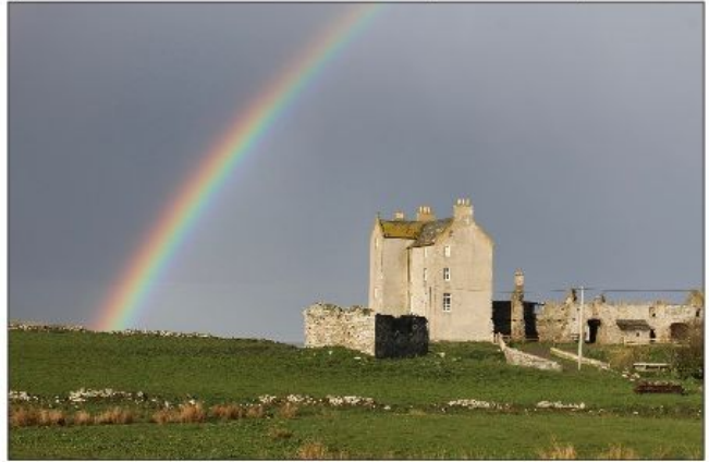
A rainbow over Freswick Castle.

On October 26, 2001 I made my way to Toronto